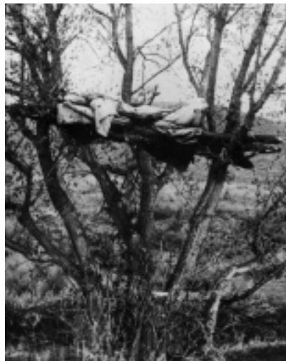
Plains Indian tree burial, or a memorial chapel in a Christian church each convey patterns of beliefs about our place in the dance of Creation and how we can keep contact with memories and the wisdom of those now returned to the realm of spirit.

In acknowledging the constant feeding upon and giving of life to other life through death, we begin to live and offer our own lives and deaths in that spirit. Ending this one cultural silence alone begins to transform our connection with all life and to bring our own lives into deeper harmony with reality.