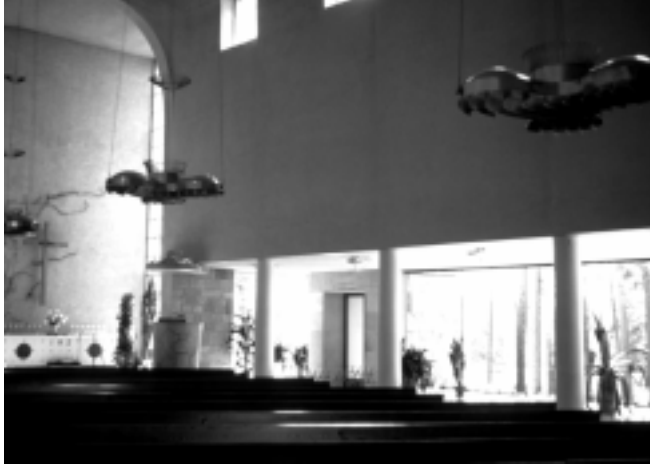
A Finnish crematory chapel opens into the forest through a ceremonial doorway, through which the dead are carried by the living – out into the forest and back into new Creation.