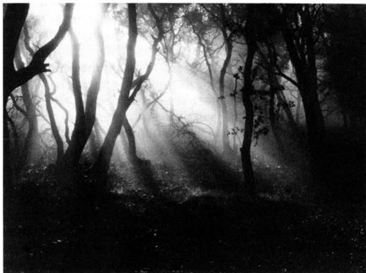
Mt. Burdell, site above Miwok village of Olompali in Marin County, California

Doing so, we stay aware of how the moon moves the tides of our feelings in harmony with those of the ocean. Being in touch with the sunrise and sunset, we stay in touch with the rhythms of work and rest in nature—rhythms of giving and absorbing that are important to acknowledge for our own health. With window seats, doorsteps, verandas, porches, and outdoor rooms, we can create places to live and work that nestle between protection and contact with our surroundings.