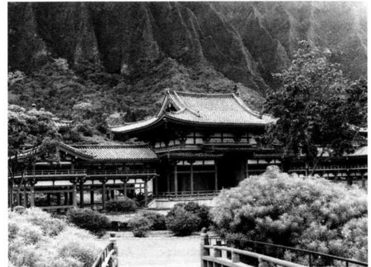
Buddhist Temple on Oahu, Hawaii

Ornament gives us a particular opportunity, free of the functional constraints of building, to infuse a building with our sense of cosmic order. The delicate interlacing geometries of Islamic ornament reflect the unfolding of the limitless forms of creation from a single source, as well as the eternally transforming relationships that tie together all of creation. The sculpture of a Scandinavian stave church or a French Gothic cathedral reflects their