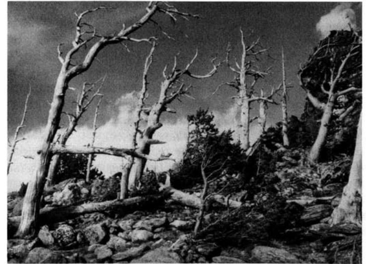
Vision questing site in Rocky Mountains

"No" places, by merely placing some limit on our actions, remind us in unequivocal terms of the necessity to limit our dreams and use of power. The sacred cows of India and the Ise Shrine in Japan show the flip sides of this